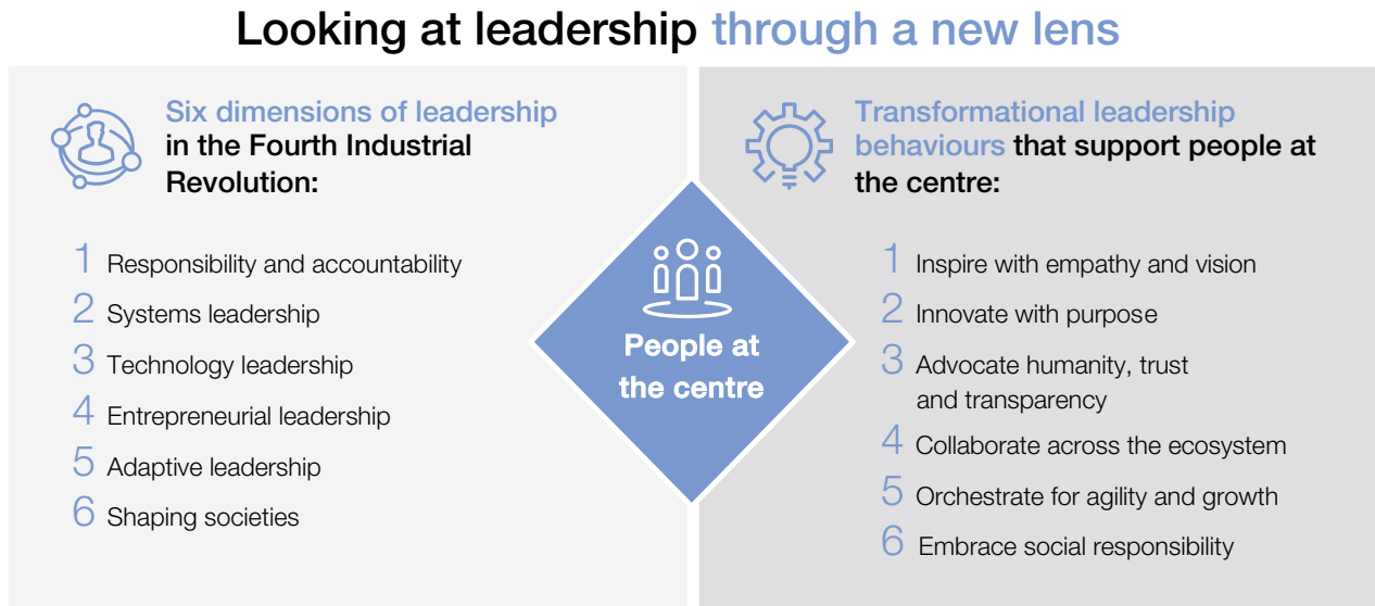
Figure 1: Leadership in the Fourth Industrial Revolution: Six dimensions of leadership and supporting behaviours